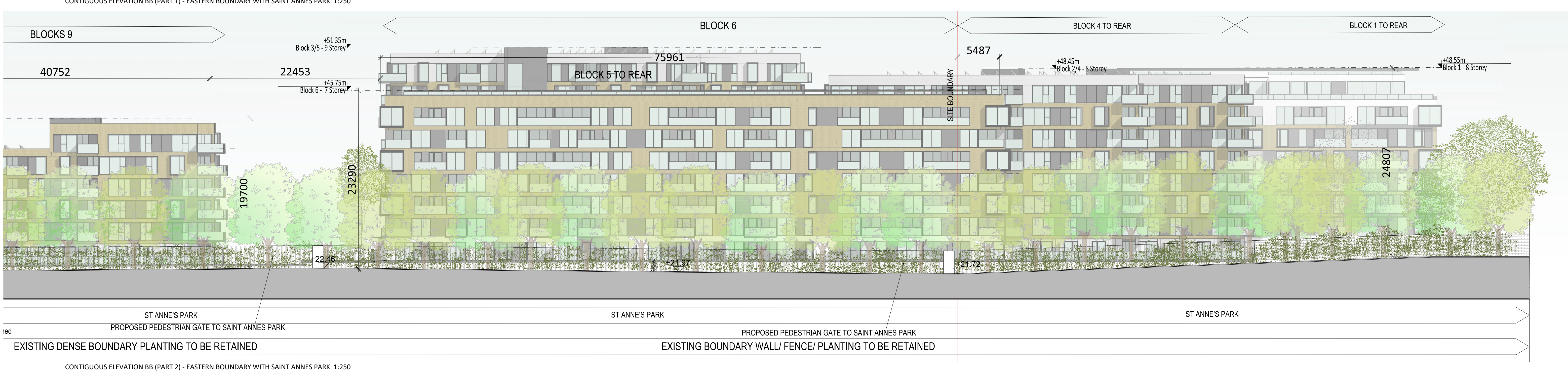
Contiguous Elevation 1/500